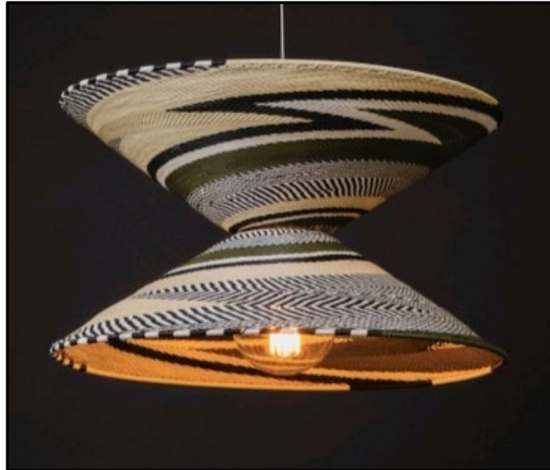
FIGURE K: Pendant light by Mash T Design Studios (South Africa), 2022.