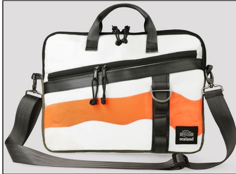
FIGURE D: Laptop bag by Sealandgear (South Africa), 2022.