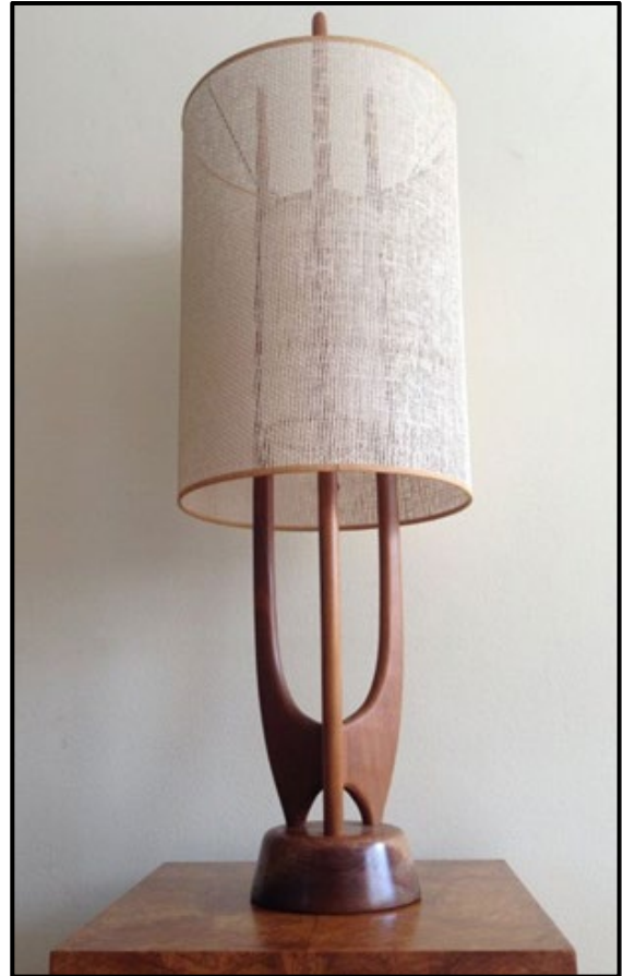
FIGURE I: Scandinavian table lamp by VH Woolums (Denmark), 1960.

Write an essay (at least ONE page) in which you compare the table lamps in FIGURE H and FIGURE I above and explain why they are typical of the movements they represent.