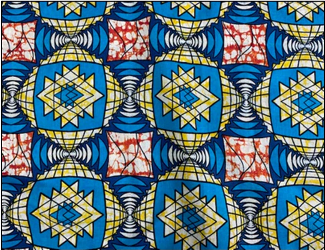
FIGURE A: African cotton print by African Sonic (Nigeria), 2021.

Analyse the use of the following elements and principles in FIGURE A above: