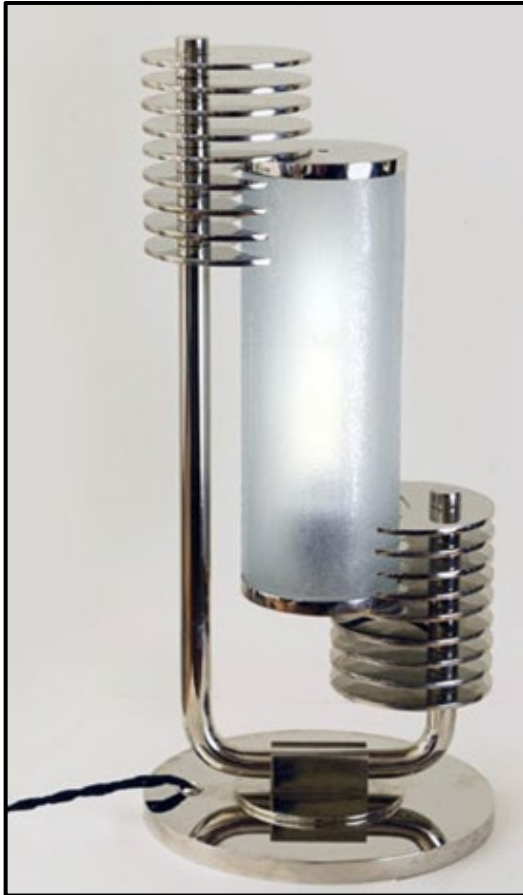
FIGURE H: Modernist table lamp (2) by Edgar Brandt (France), circa 1931.