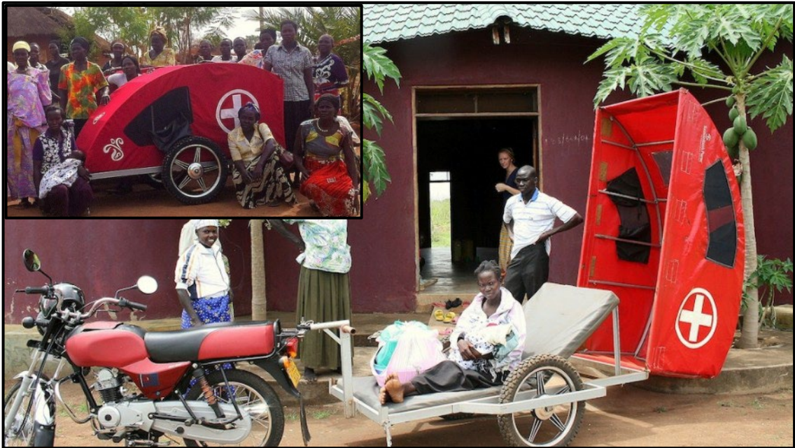
FIGURE J: Zambulance by Zambikes (Zambia), 2015.