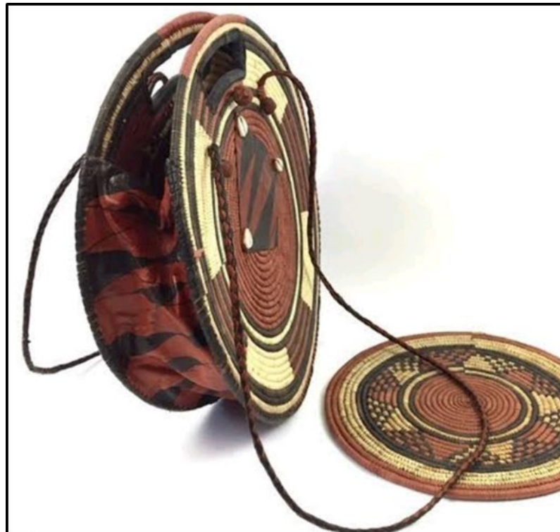
FIGURE E: Hausa tribal bag (Nigeria), circa 1960.

Write a paragraph in which you compare the bag in FIGURE D with the bag in FIGURE E.