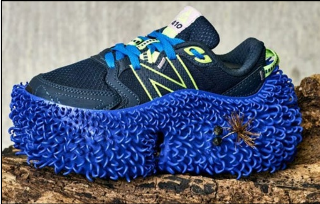
FIGURE L: Rewilding Sneaker by Kiki Grammatopoulos (Greece), 2023.

The sneaker design above scatters seeds while being walked in. The design is influenced by the process of furry animals that disperse seeds as they move through the veld.