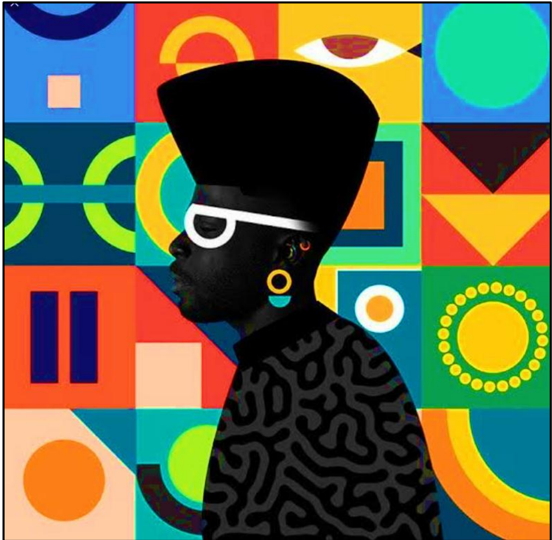
FIGURE A: Portraits and Colour wallpaper design by Temi Coker (USA), 2019.

Discuss the wallpaper design in FIGURE A above by referring to the following elements and principles: