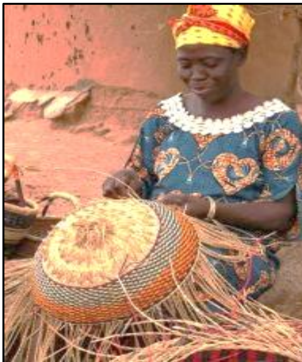
FIGURE K: Zulu basket weaving , Hlabisa, KZN, date unknown.

5.2.1 Discuss the value of practising/applying traditional crafts in contemporary society. Refer to FIGURE K to guide your answer. (2)