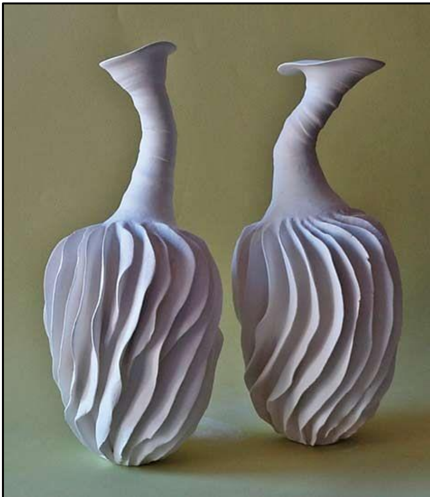
FIGURE B: Dancing Egrets (water bird) by Cecilia Robinson (South Africa), c. 2012.

Analyse the use of the following terms in relation to FIGURE B above: