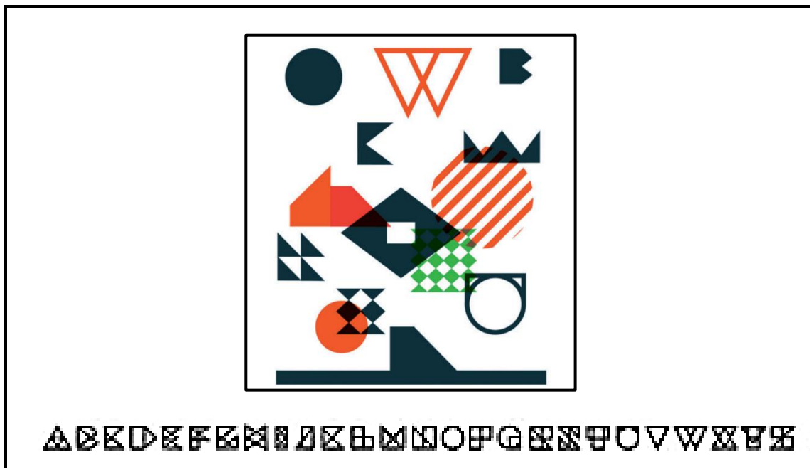
FIGURE D: BaBa Typeface by Garth Walker (South Africa), 2002.