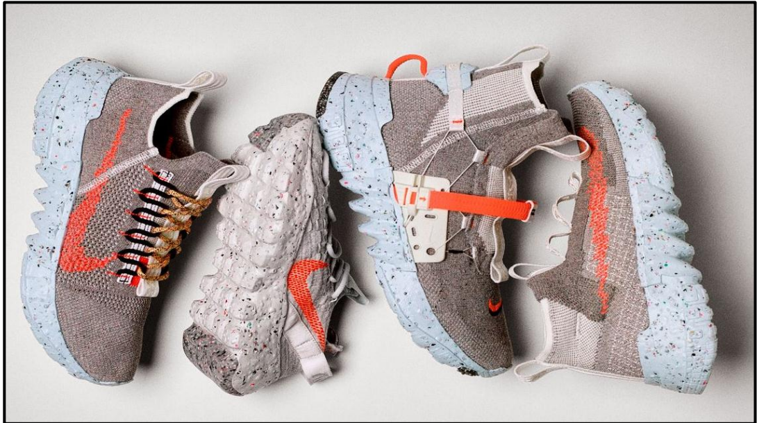
FIGURE L: Nike Space Hippiie 4 footwear by Noah Murphy-Reinhertz (USA), 2020.

Space Hippiie's sneakers are made from 85–90% recycled content. These eco-friendly sneakers are made entirely from scrap materials from the factory floor, including plastic bottles, T-shirts, and post-industrial scraps. 'Move to Zero' is Nike's journey towards zero carbon and zero waste to help protect the future of sport.